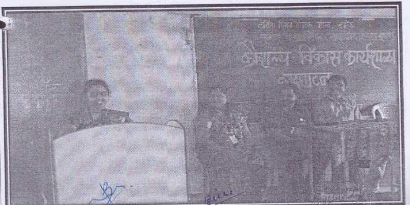
Dr. ... INCHARGE PRINCIPAL Nashik Shikshan Prasarak Mandal Arts and Commerce College Igatpuri, Dist-Nashik