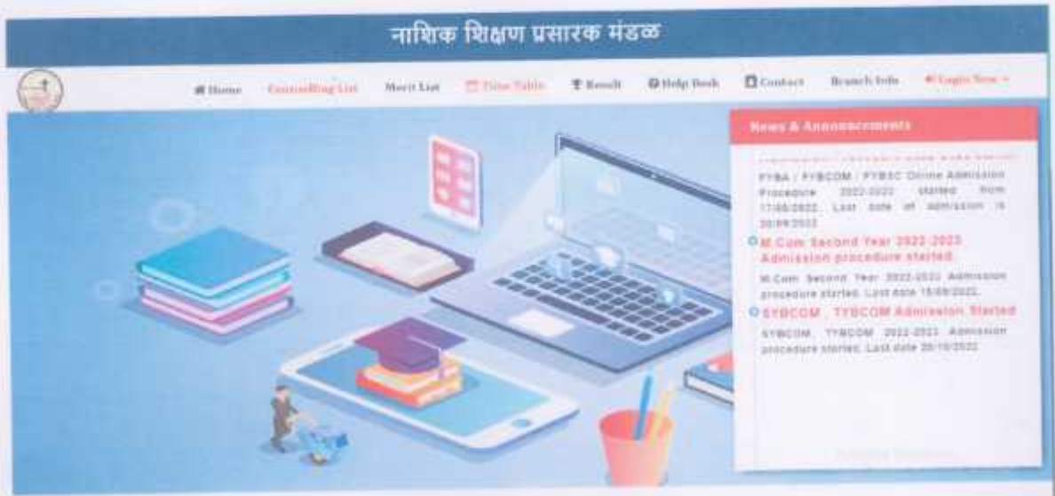
Main Software Screen